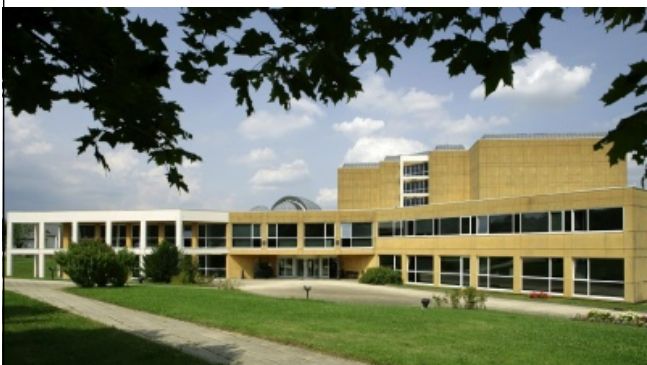
The Archives Départementales de la Moselle (Departmental Archives of the Moselle), France