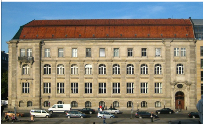
The Brandenburgische Akademie der Wissenschaften (Berlin-Brandenburg Academy of Sciences and Humanities), Germany