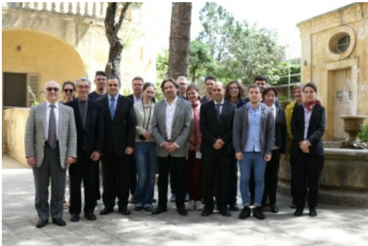
A group picture of Country Managers and APEF staff participating to the meeting in Malta

APEF biannual Country Managers' meeting was held at the National Archives of Malta . An important occasion to update each others on issues, projects, future plans. If you are interested in learn more, please do not hesitate to contact info@archivesportaleuropefoundation.eu